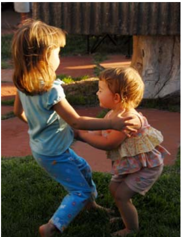
Messicks messin' around