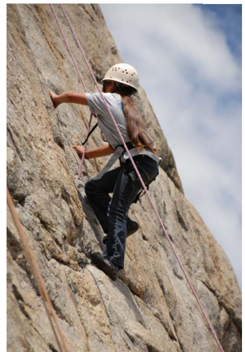
This little girl out climbed everybody in the Paiute group!