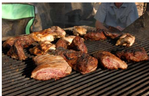
BBQ Tri-tip and chicken