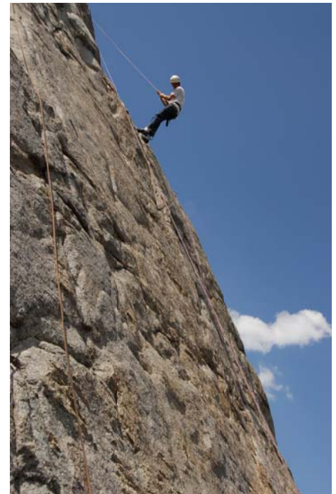
Coming down the up staircase in Rock Creek Canyon