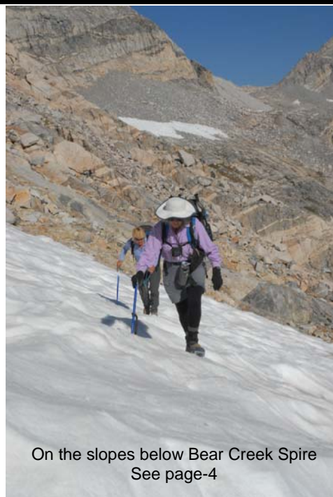
On the slopes below Bear Creek Spire See page-4

Benefactor $10,000+ Angel $5000+ Partner $2000+ Contributor $1000+ Sustainer $100+ 20-20 Wine Company Mammoth Mountaineering Supply