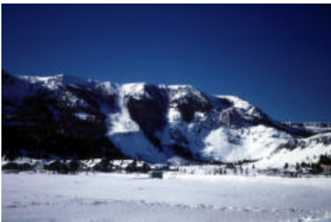
"As you drive into Mammoth Lakes, the Sherwin bowls are ... off to the left."

This will no doubt feel different if you have been turning with a predominately front weighted ski. It may even require a little experimenting with putting too much weight on the back ski to feel the relativity. Ideally, there should be an equilibrium of pressure as you edge and steer both skis through the turn. Even the lead change towards the next turn needs that constant steady pressure that helps to shape one turn into the next. Experiment with trying to press off